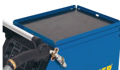
Protective rubber mat for tools