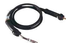
Remote control for the torch